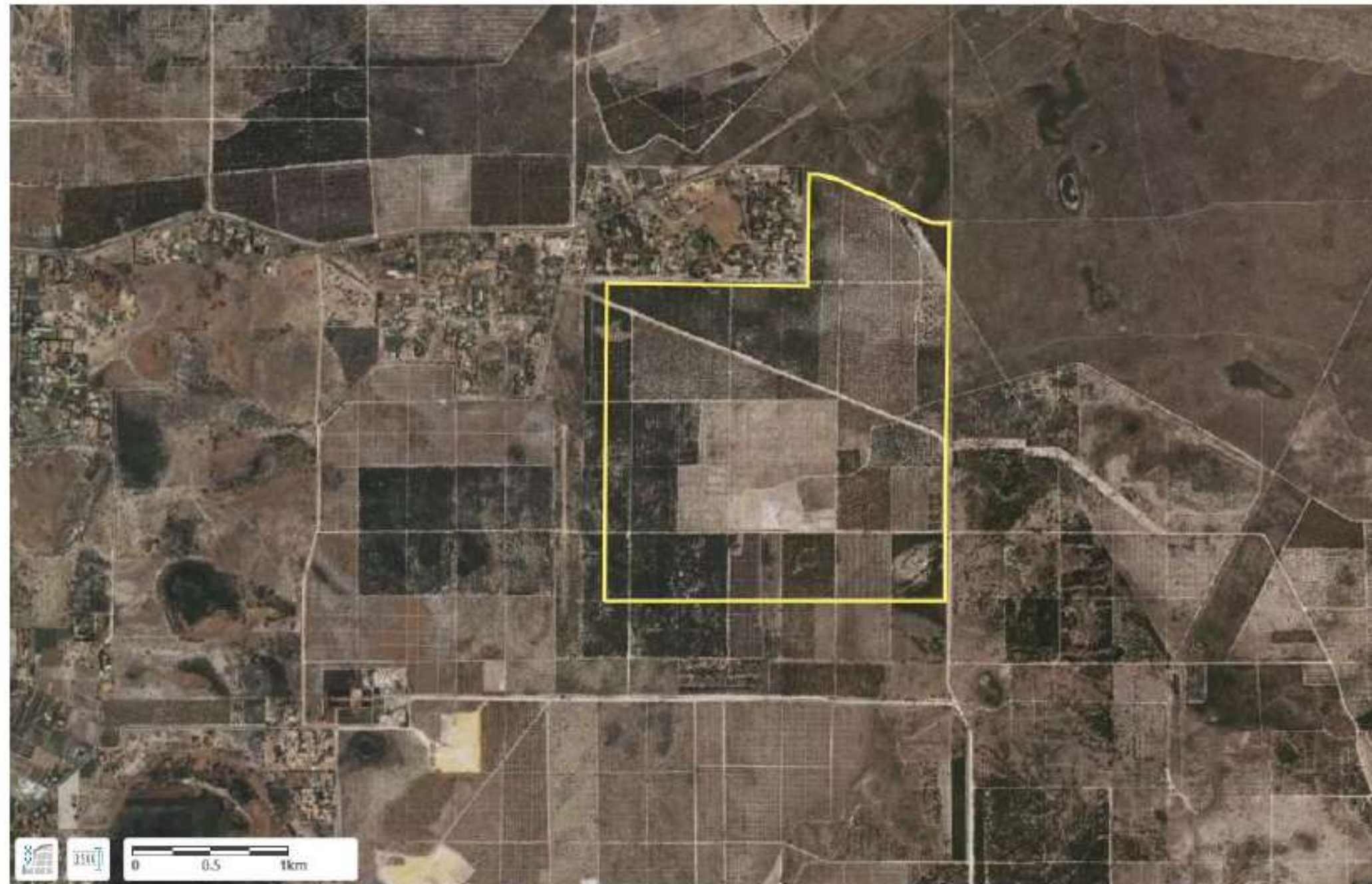
Figure 1: Map of the boundary of the prescribed premises

The boundary of the prescribed premises is shown in the map below (Figure 1).