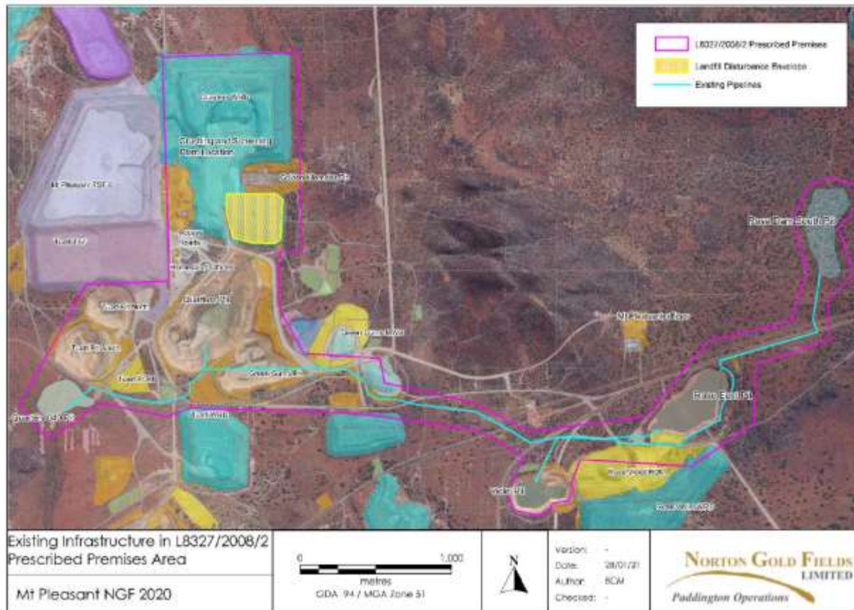
Figure 1: Map of the boundary of the prescribed premises

The boundary of the prescribed premises is depicted by the pink line shown in the map below (Figure 1).