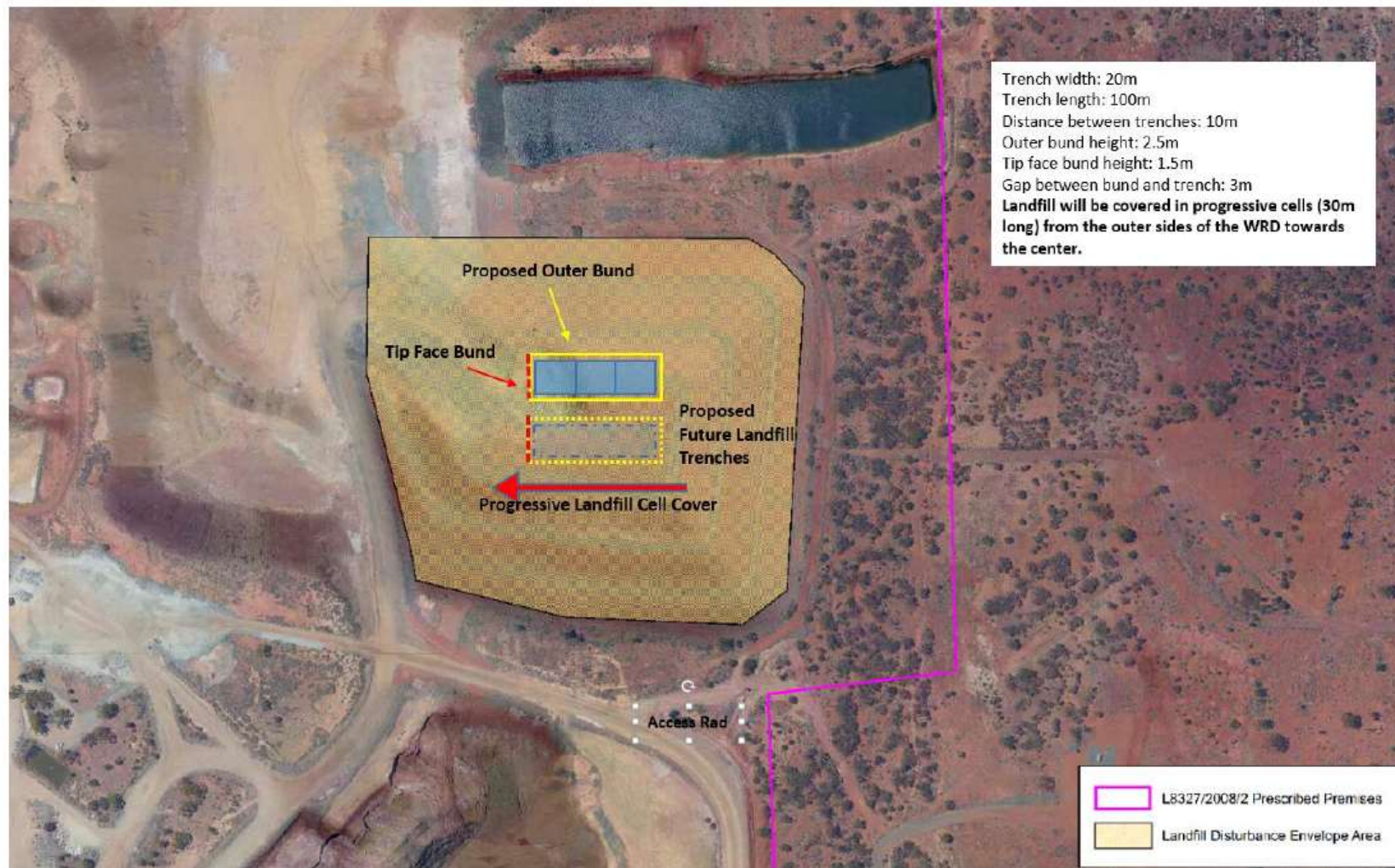
Figure 2: Design of Landfill Facility