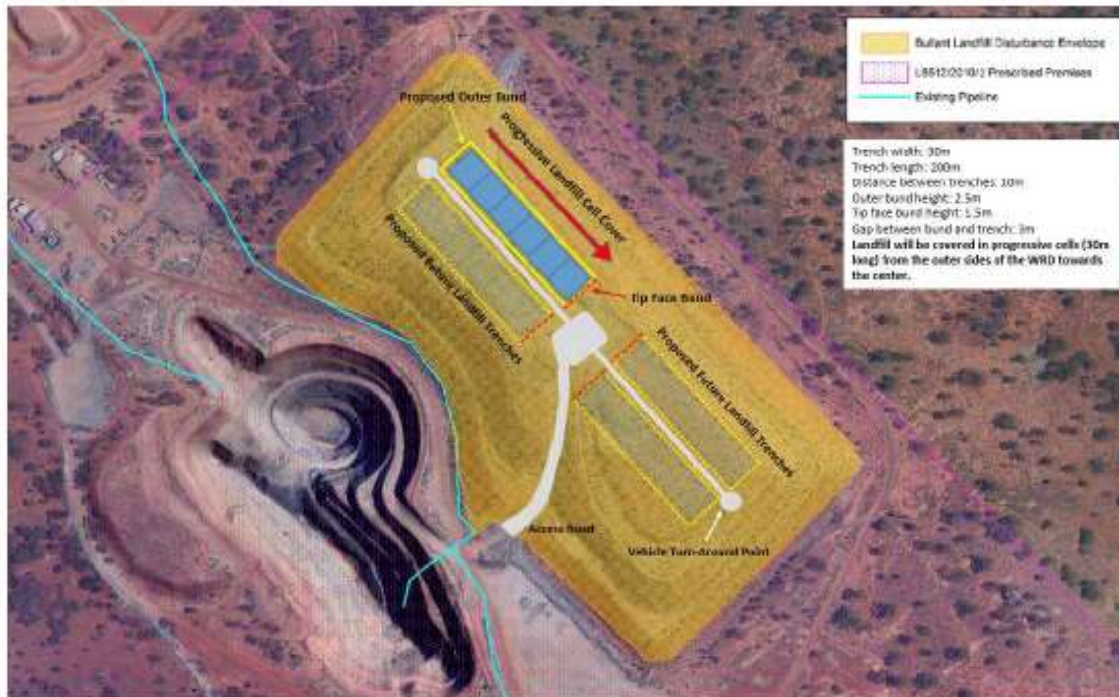
Figure 2: Design of Landfill Facility