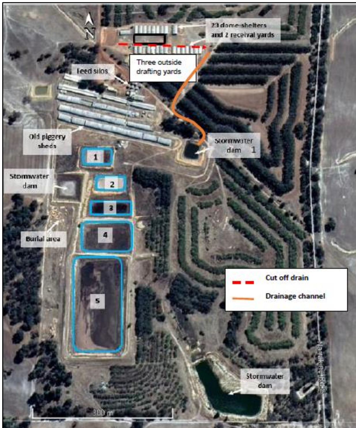
Figure 3: Outlines the infrastructure within the prescribed premises.

The infrastructure of the prescribed premises is shown in the map below (Figure 3).