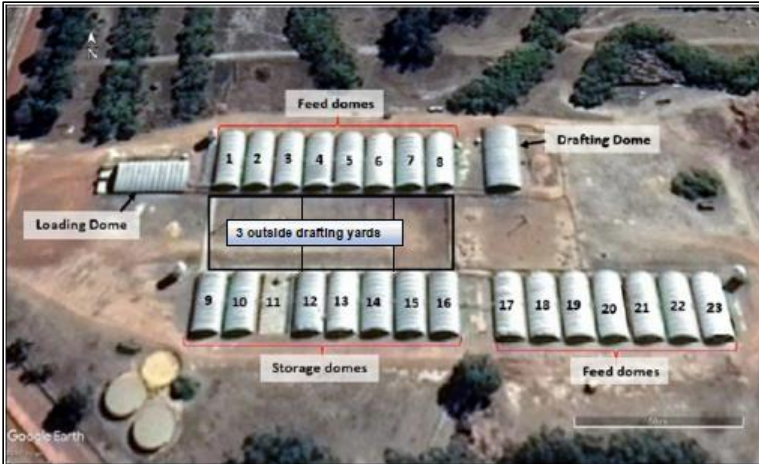
Figure 2: Outlines the three outside holding yards, the feed shelters, loading shelter and drafting shelter.

The dome shelters of the prescribed premises are shown in the map below (Figure 2).