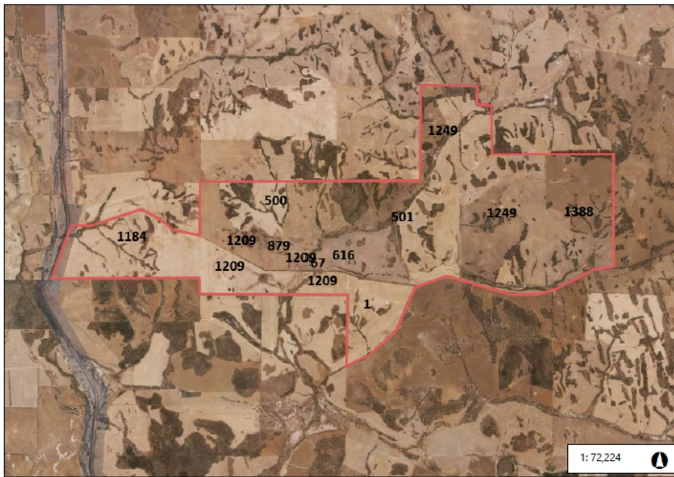
Figure 1: Map of the boundary of the prescribed premises showing Lot numbers

The boundary of the prescribed premises is shown in red in the map below (Figure 1)