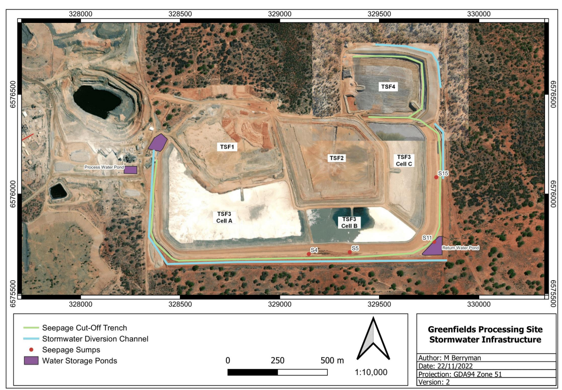
Figure 1: Stormwater infrastructure for the Greenfields processing site TSF

A total of six VWPs and three groundwater monitoring bores have been installed at TSF4 to monitor the potential impacts of tailings seepage on the phreatic surface within the embankment and ambient groundwater quality, respectively.