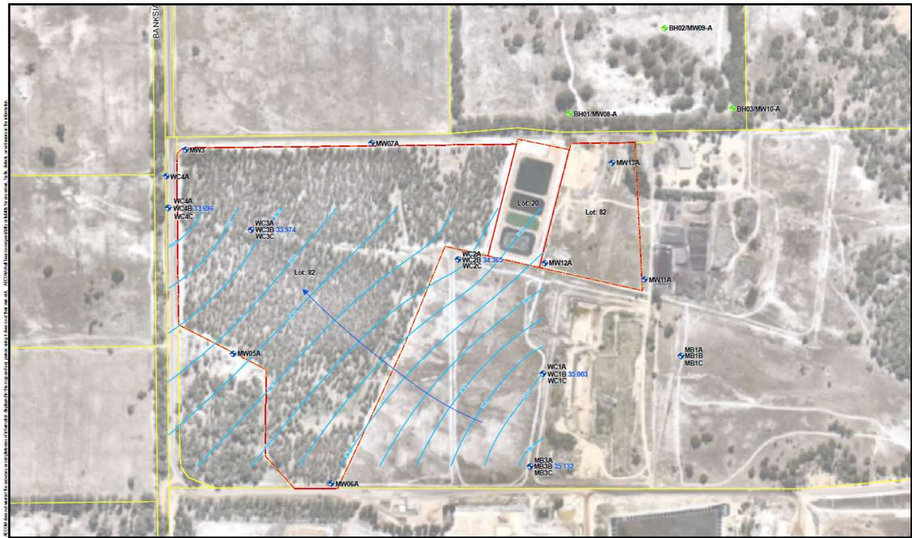
Figure 3: Groundwater directional flow May 2017