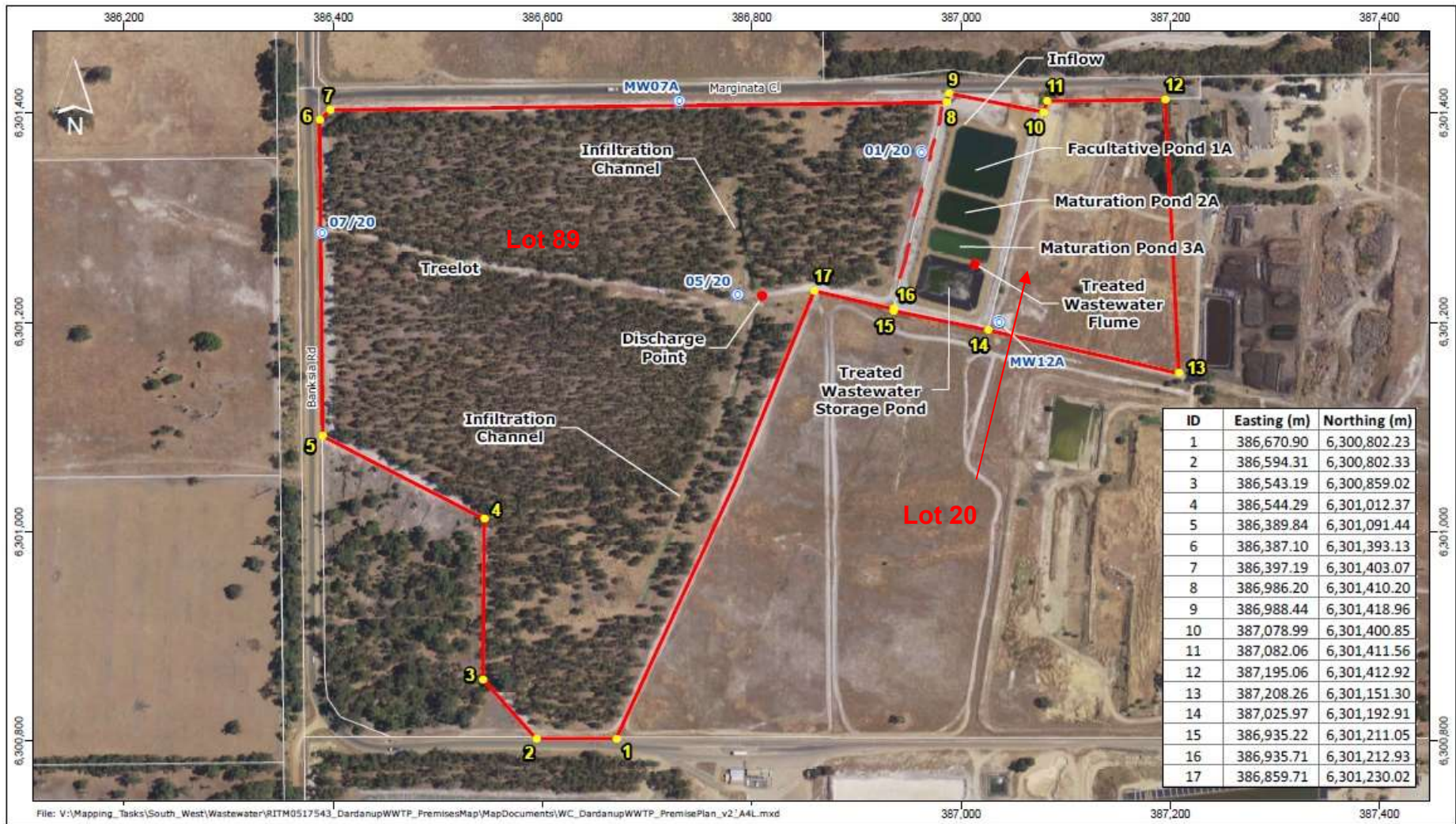
Figure 2: Premises boundary showing monitoring bore locations