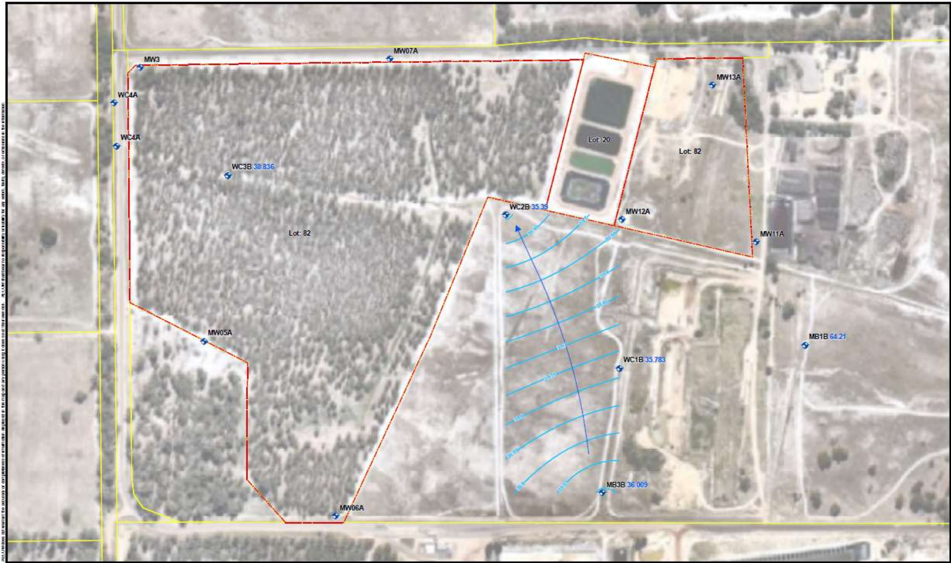
Figure 4: Groundwater directional flow November 2018